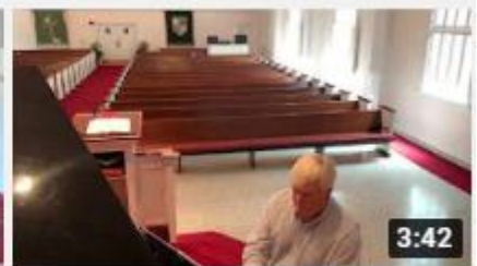
Sweet Hour of Prayer

Covid has kept us distanced but has not stopped the people of the First Presbyterian Church of Mount Dora! We are worshipping in person and live streaming to your home. Music is pouring out and lifting the spirits of all!