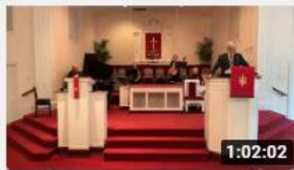
August 30 Service