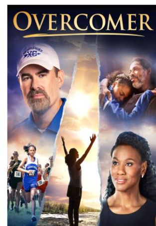
"Overcomer" Sept 23 at 7:00pm Fellowship Hall