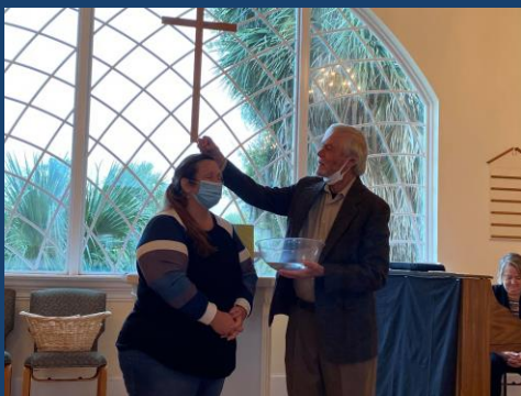
Preschool Chapel talk on baptism

Elliot also reminds us that our duty is obedience. However, "obedience may lead me not to the fulfillment of my own ideals of spirituality but to very unexpected situations...meant to teach me to be meek and lowly in heart...And there, to my surprise, I find rest." Not where we think we should be but where God wants us to be, where we really need to be.