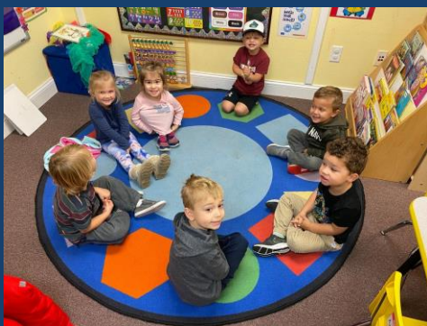
Preschool circle time