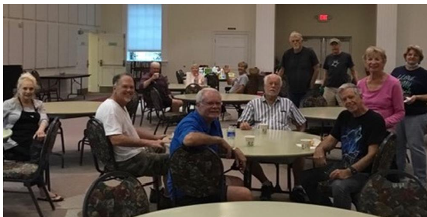
Thank you to our Wonderful Work Party Crew!